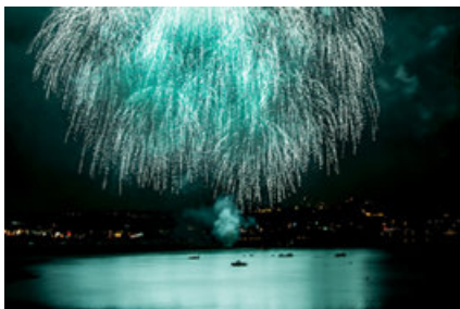
Fireworks (Click on image to zoom)

Most of the time when shooting fireworks, the subject is the fireworks themselves but for this photo I tried to concentrate on the boats in the bay that were there to see the fireworks. To time the photographs, I had the camera locked into a tripod and used a cable release with the camera set to bulb mode so that the shutter stayed open as long as I held the button on the release. Taken at 2.7 seconds, f/16 and ISO 400