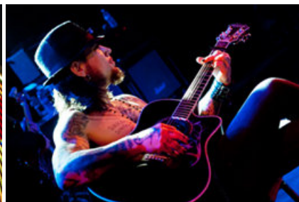
Dave Navarro (Click on photo to zoom)

This photograph is of a ferris wheel in motion and the pattern is actually made up of the light trails as the wheel turns. This was taken using a 3 second shutter speed to give the wheel time to move enough to get a good pattern. I zoomed in very close so that the image was more abstract, and to me, more interesting. Taken at 3 seconds, f/22 and ISO 200